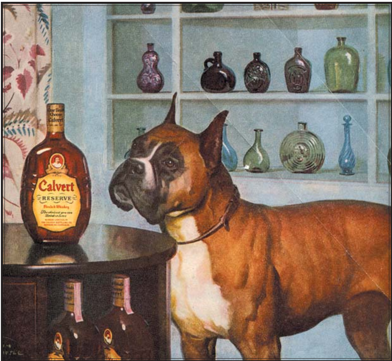
[Fig. 1] “He’s added another choice item to his collection!”

Recalling my incomplete knowledge of bottle-collecting history, I was surprised when my wife discovered the Calvert advertisement, featured in this article, in a box of advertisements at a recent antiques show. I know from research that people saved bottles for hundreds of years and seriously collected old bottles categorically at least as far back as the 1880s. Those late 19th century collectors, in fact, focused on just such bottles as featured in the “collection”