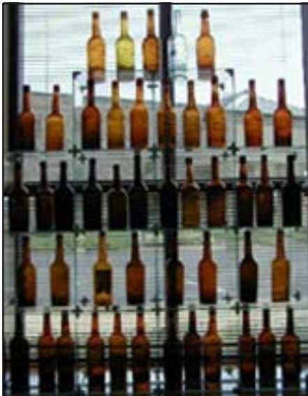
Display in one of the office's windows

Chevalier Old Castle Bourbon, a horizontal Wormser and a Wormser Fine Old Cognac.