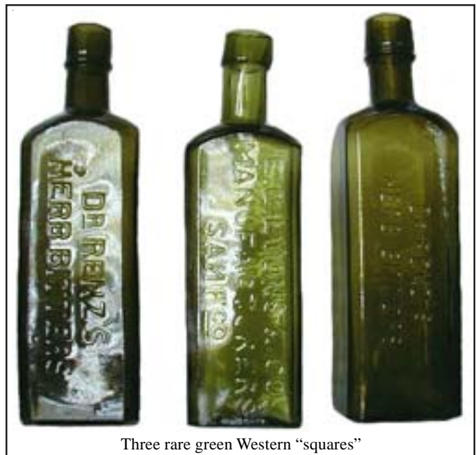
Three rare green Western "squares"

Ralph began to write periodic letters to Mike about re-acquiring "The Genuine". None were answered, until