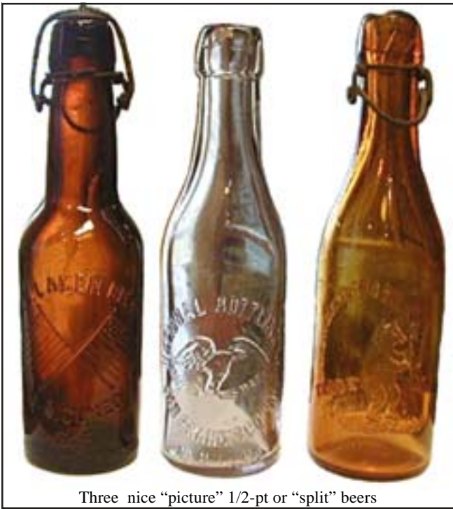
Three nice "picture" 1/2-pt or "split" beers

At that time, the notion of buying them was impossible - $10-25 was a princely sum, and the half-pint beers at $1-5 were at least feasible."