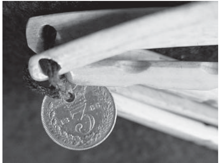
Figure 4 Close-up

they are not such. The set of three fish are actually some form of a game counter, similar to poker chips. Note that they do not have holes in them so that they could be tied onto a string or ribbon as one would do with a teether or modern pacifier. This does not prevent swallowing, but it does help in the recovery if it is accidentally swallowed, kind of like a circus sword swallower does in his act.