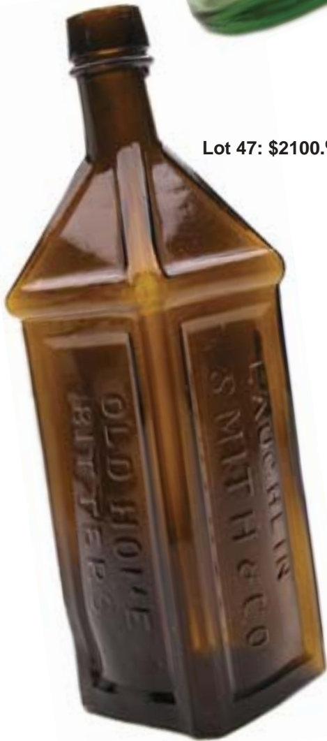
Lot 47: $2100.00