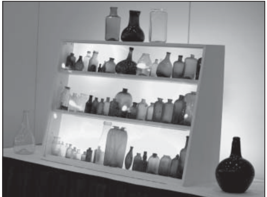
Black Glass Whiskey Bottles - Carl Sturm