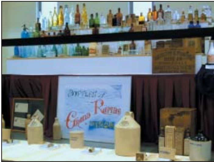
Grand Rapids, Michigan Bottles - West Michigan ABC