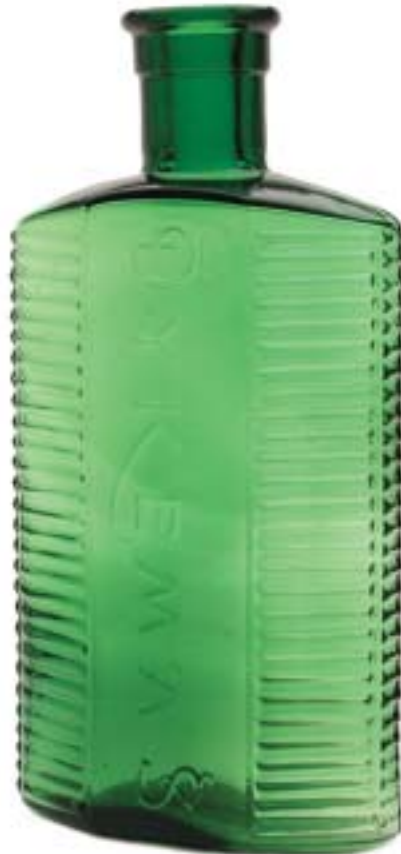
Lot 26: $2050.00