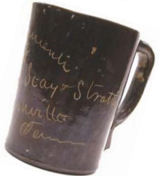
"Compliments of Stratton, Seay & Stratton, Nashville, Tenn. Lot 45 - $225.00"