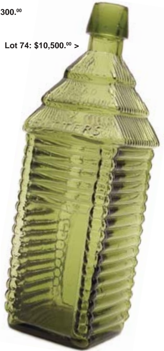
Lot 74: $10,500.00 >