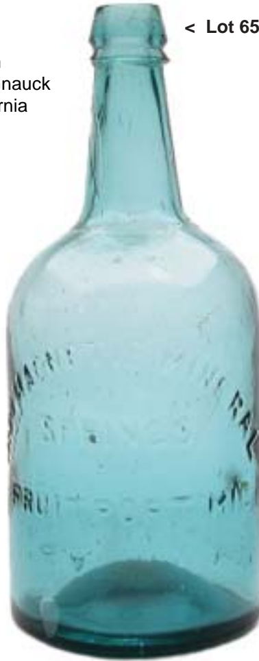
< Lot 65: $2300.00